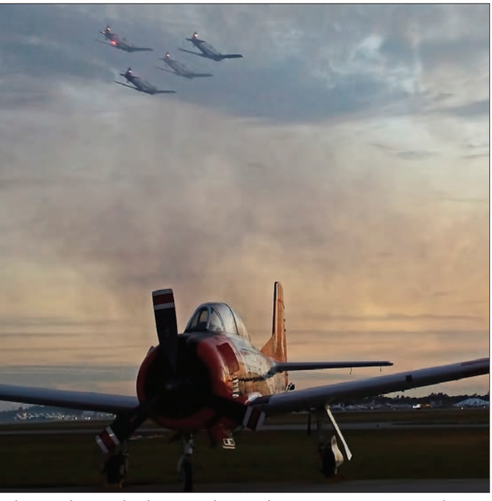
Flying through the smoke makes an interesting photo