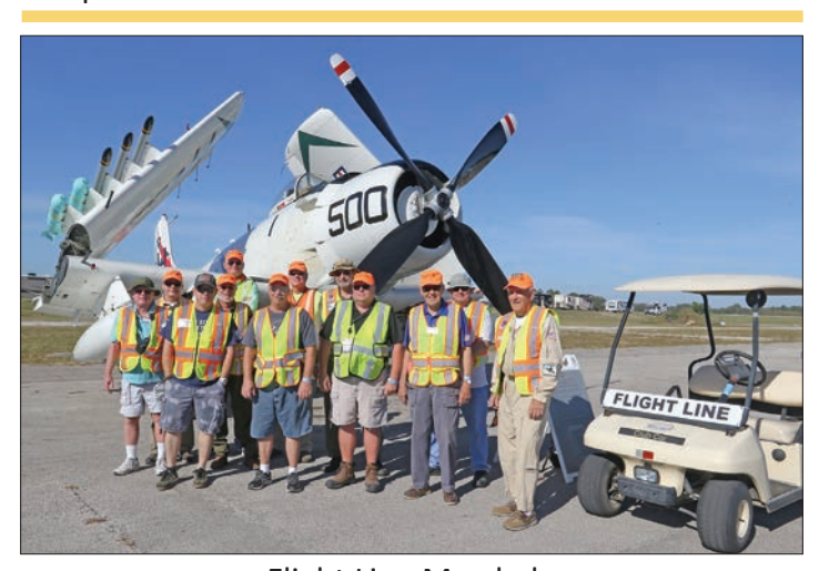
Flight Line Marshals

DONATIONS - Continued at a high level as a significant number of new model aircraft, and some very meaningful aviation artwork, and minor aircraft components.