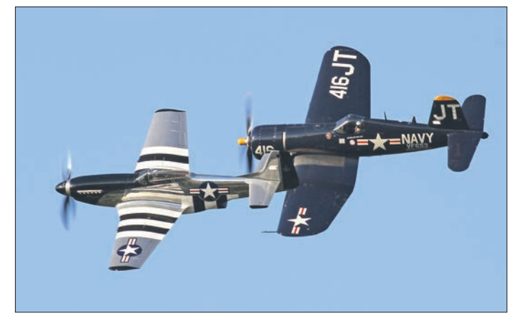
Class of '45 performing at the Saturday show