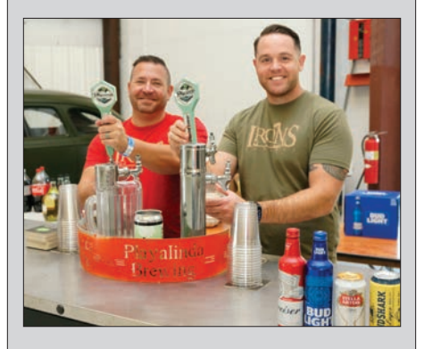
Two bartenders from Playalinda Brewing made "Happy Hour" happy!