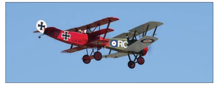
The Red Baron is going to try to shoot Snoopy down!