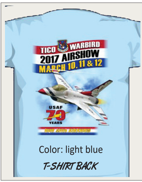
Limited Edition - Will not be reordered