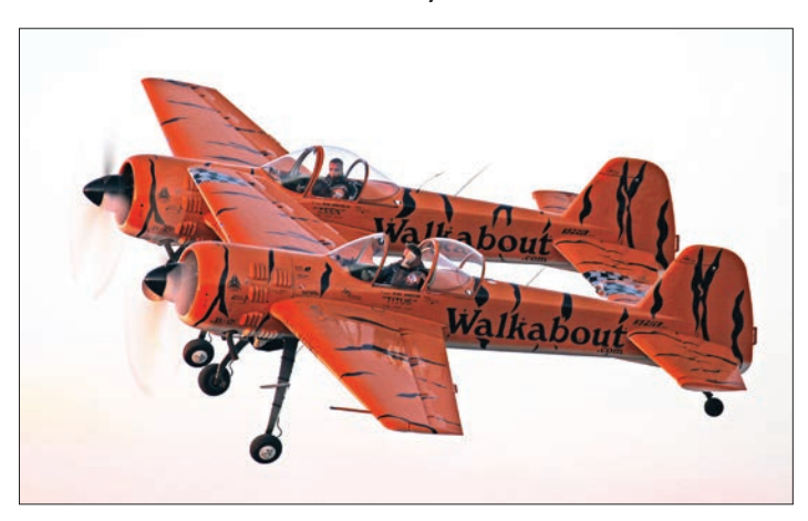
Twin Tigers performing at the Friday evening show