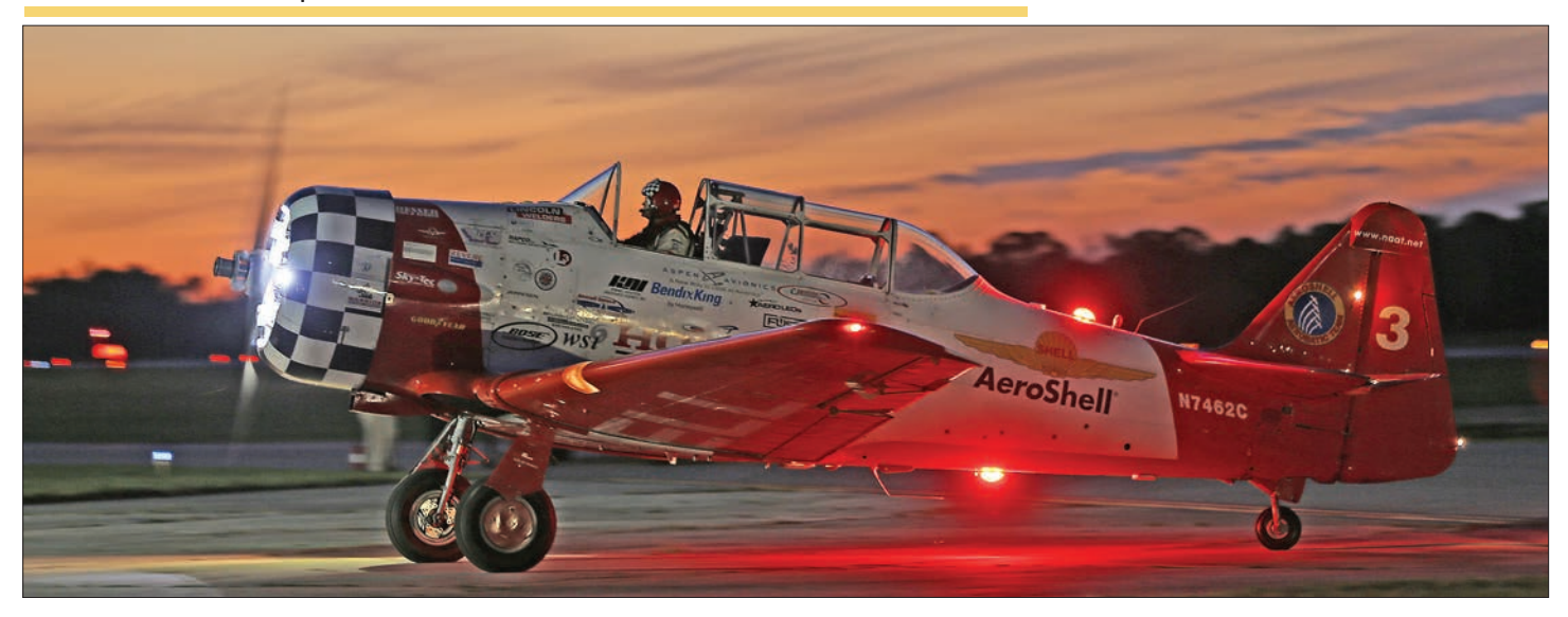
Aeroshell's number 3 AT-6 moving down the taxiway for their spectacular evening show.