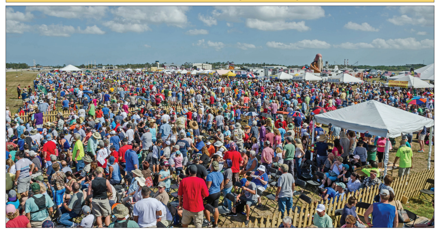
Saturday AirShow attendance must have set a record...what a crowd!