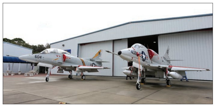
Two Skyhawks parked outside the Vietnam Hangar