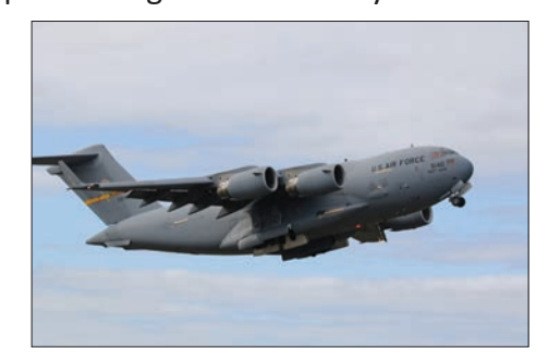
The Thunderbirds ground support C-17 taking off on runway 18/36; about a quarter of the runway was used!