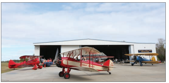
Four Biplanes parked on the ramp at VAC