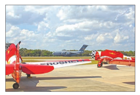
The USAF Thunderbird's support C-17 arrives at the museum.

Fill out an application on our website or stop at the Gift Shop and get an application.