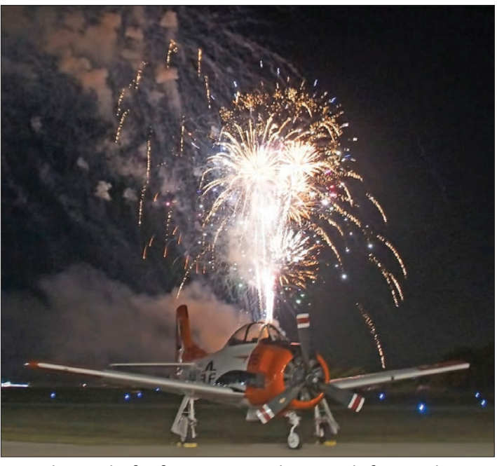
The end of a fantastic air show with fireworks